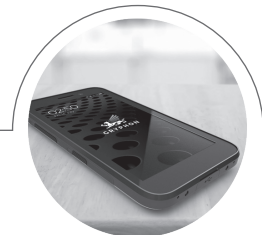
Customer controlled & verifiable security